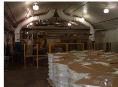
Underground gasoline sump containers produced by NCC

Full coverage of these projects and the special skills each team member brings to the table can be seen in an upcoming feature length article in CF Magazine's October issue.